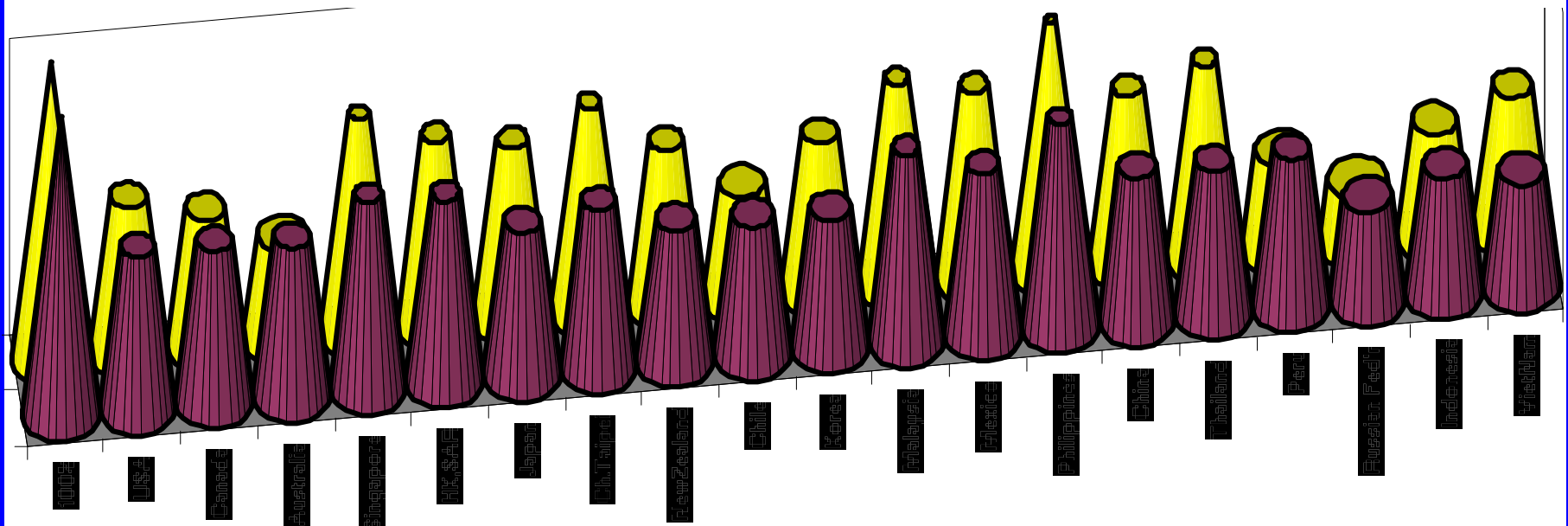
APEC members ranked by overall policy conditions

The taller the trade cones, the more the trade of an economy is concentrated in sectors that use information technologies intensively, making the policy environment that much more important to maintain trade competitiveness